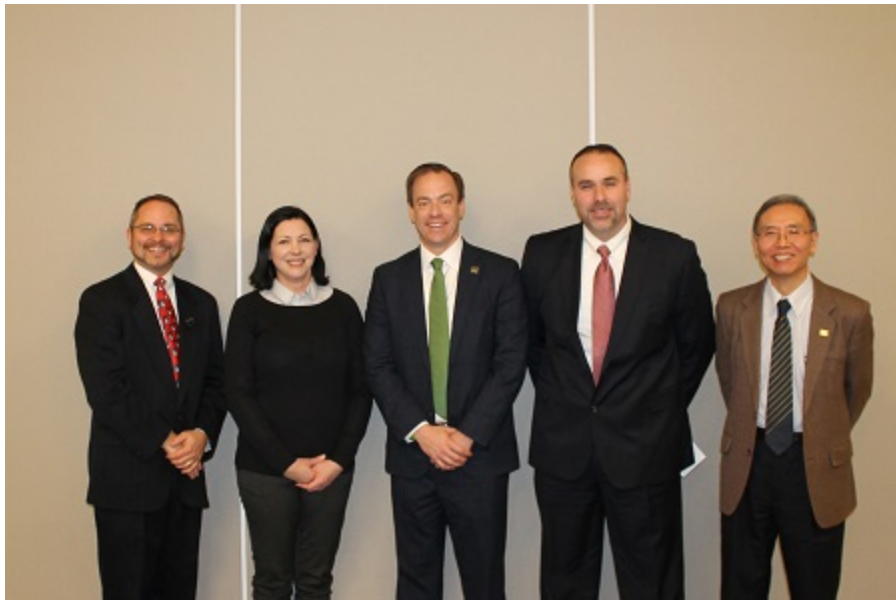
Mid-America Transplant representatives attended the Colloquium