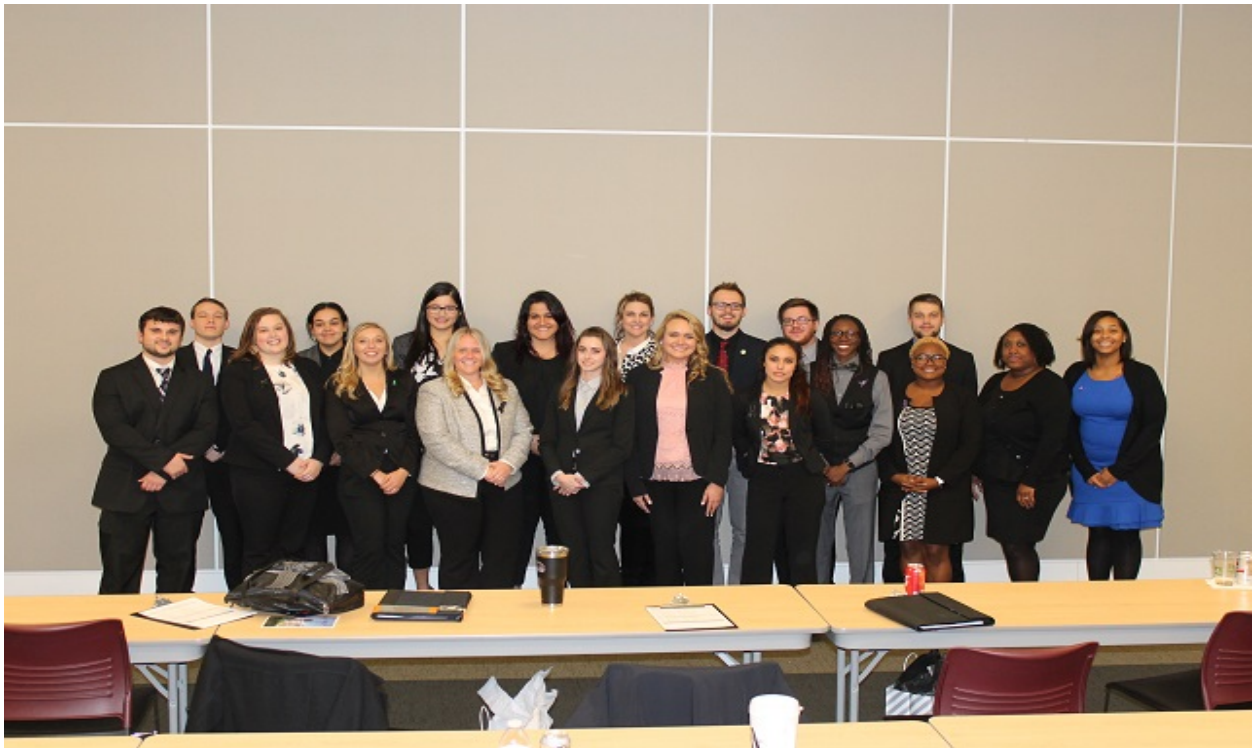
Group photo of presenters