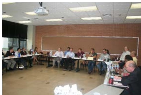
Opening Discussion with IST Advisory Committee Members