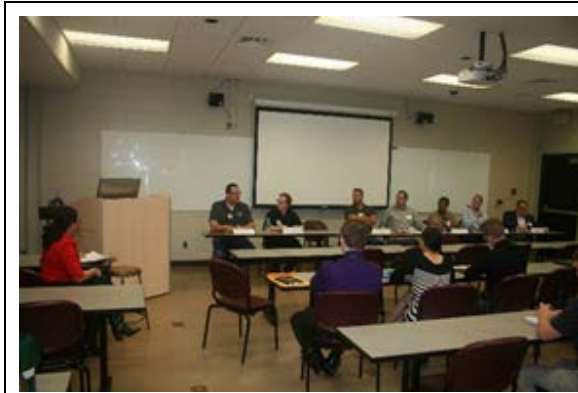
Introducing IST Advisory Committee Members