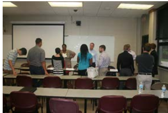
One-on-one meeting with the IST Advisory Committee Members after the Panel Presentation